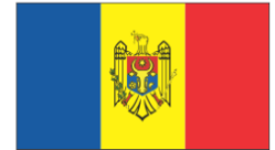
Republic of Moldova