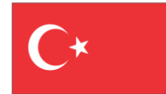
Republic of Turkey