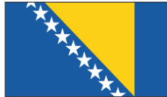
Bosnia and Herzegovina