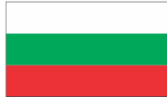
Republic of Bulgaria