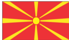
Republic of North Macedonia