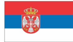
Republic of Serbia